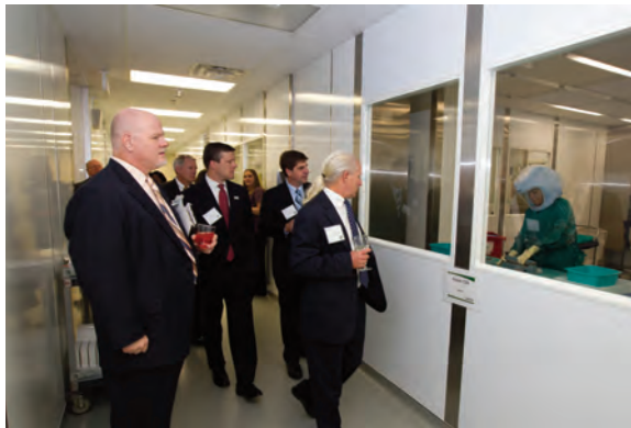
Field Tour of the Tissue Bank located at the UM Life Science & Technology Park

SFWIB partnered with Miami Dade College affording a cohort of 40 eligible young adults to fully engage in a STEM-related